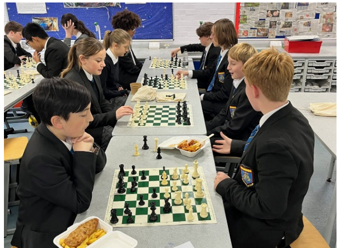
Years 9 and 10