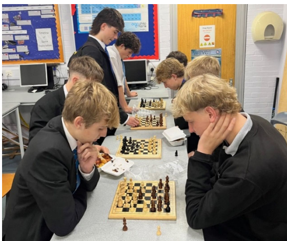
Year 11 play 6 th form