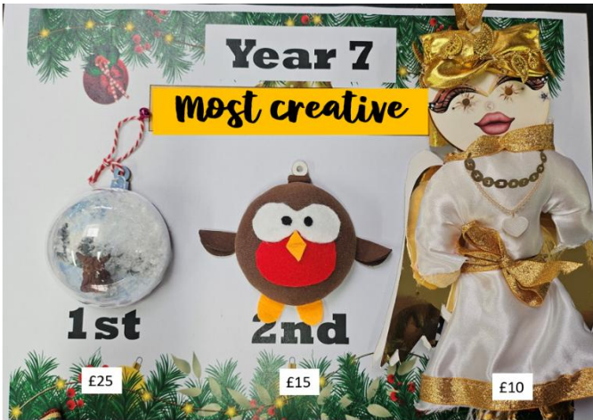
Grace Young 7S1