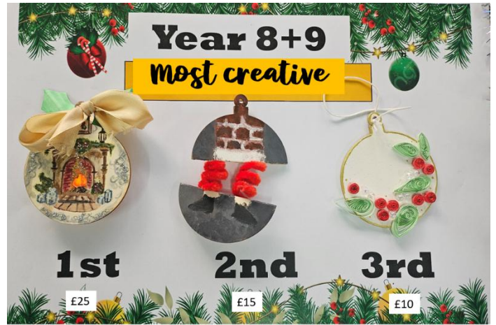
Holly Bodenham 9G2