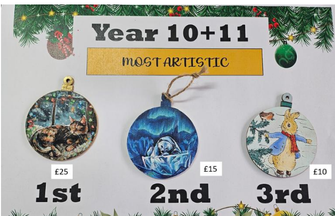
Ava Bayston 11S2