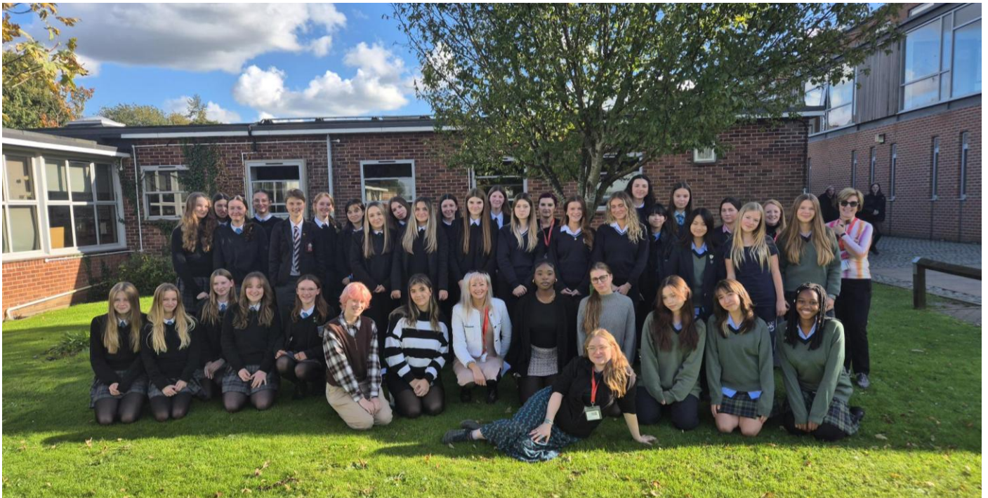
The first workshop (hosted by Balcarras) for the Young Designers 'Wearable Art' Challenge 2025!