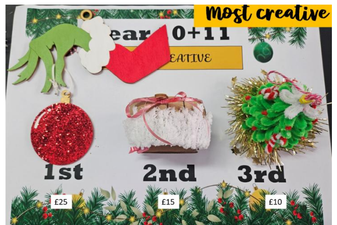
Poppy Foulkes 11S2